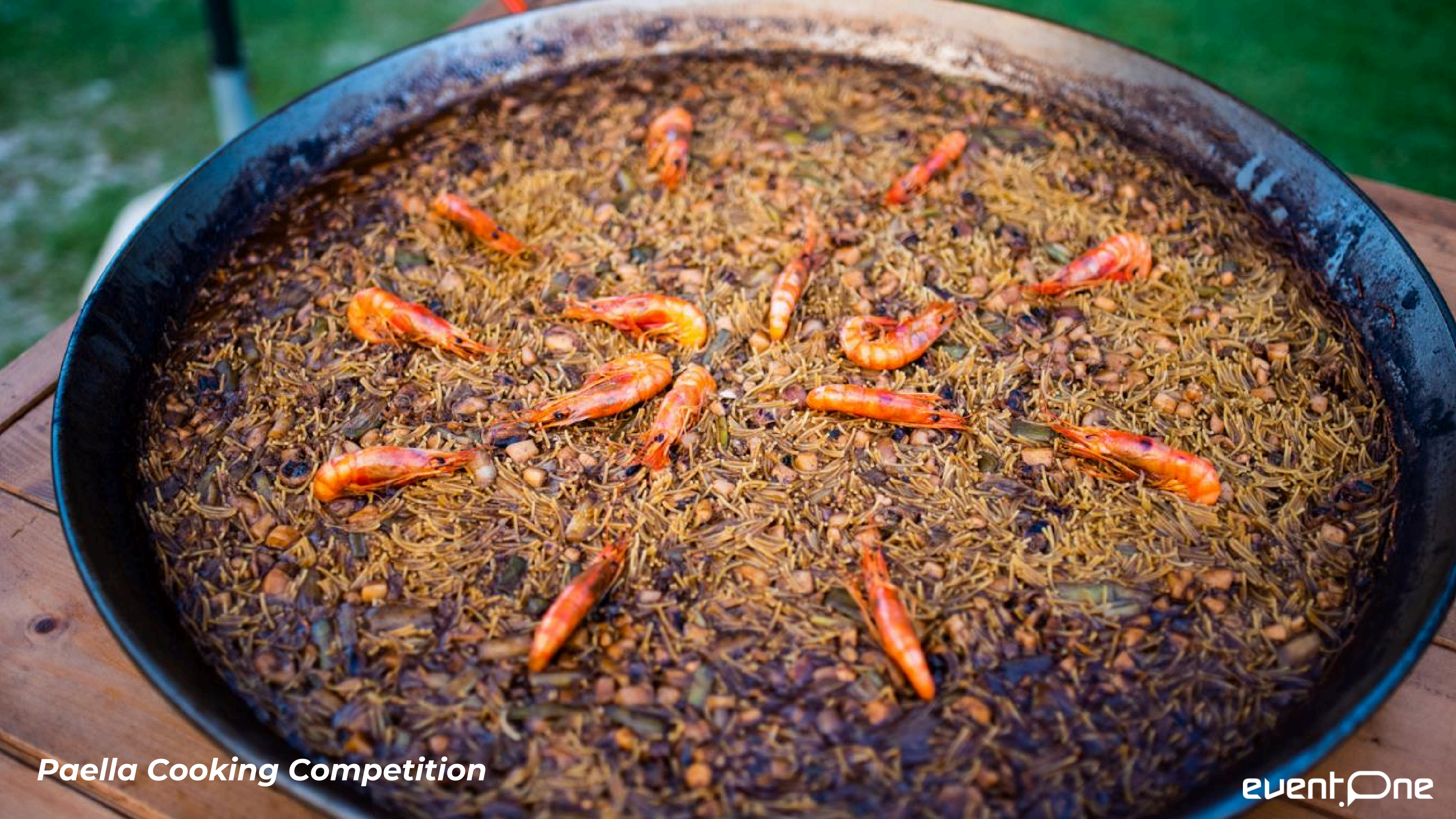
Paella Cooking Competition