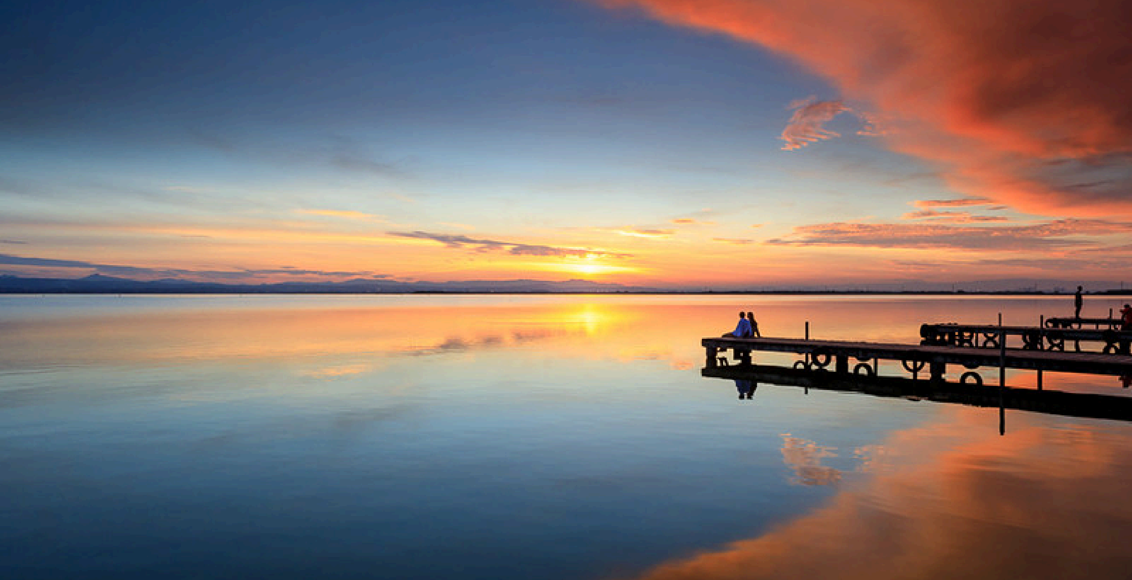
Sunset at Albufera's Natural Park